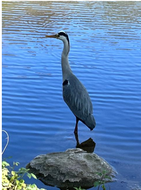
Lawn Lakes, April 2025